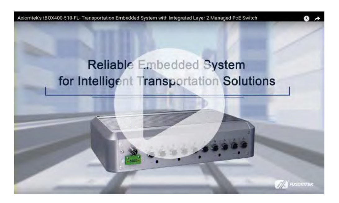
Video 1. Axiomtek's tBOX-400-510-FL is an embedded controller with a built-in Layer 2 Managed PoE switch that supports applications like video management and surveillance in onboard environments.

With PoE capabilities, the tBOX PCs are capable of both connecting to and powering a variety of devices in trains, buses or transportation centers like IP cameras, sensors and low-power displays (Video 1).