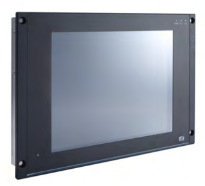
Figure 2. Axiomtek's GOT touch panel PCs are certified/compliant with the EN 50155 standard for use in vehicle or rail environments (Source: Axiomtek ).

To deliver infotainment to riders at transportation stations or onboard mass transit vehicles, Axiomtek's comprehensive GOT line of fanless touch panel PCs offer extensive features such as options between heavy-duty, light and stainless steel, as well as an EN 50155 compliant touch display for onboard and wayside communications.