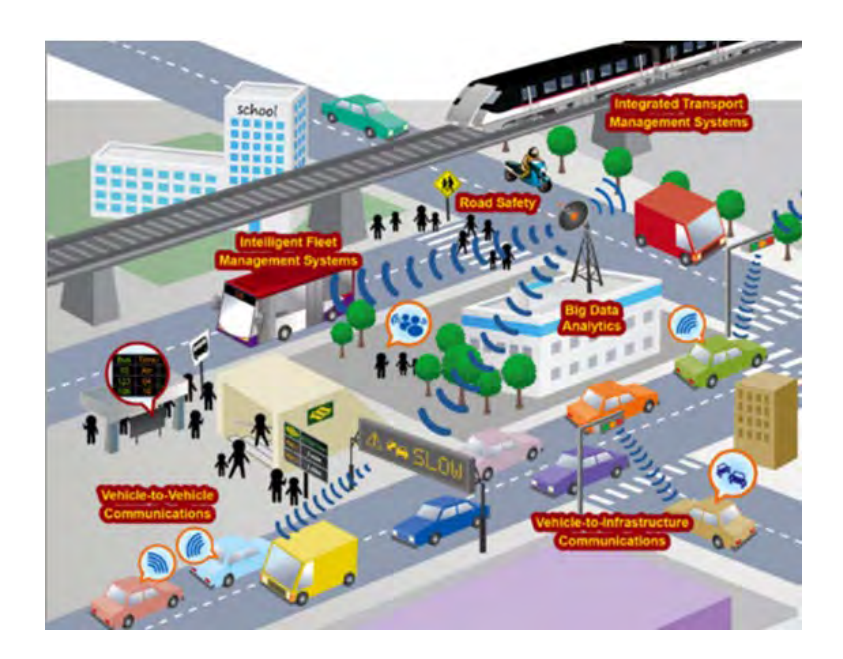
Figure 1. Multiple systems and technologies contribute to intelligent urban transportation today.

As the diagram shows, many different types of infrastructure are needed to complete the picture of a truly modern ITS: