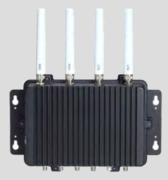
Product Reference 1, Figure 1. The eBOX800-511-FL supports 7th generation Intel® Core i5 or Celeron processors in an extremely rugged package that makes it ideally suited for deployment in edge traffic management and control systems

The eBOX800-511-FL, for example, runs on 7th generation Intel® Core i5 or Celeron processors, allowing transit system integrators to balance performance and power consumption with the exact needs of their application (Product Reference 1, Figure 1). The devices include up to 16 GB of DDR4-2133 SO-DIMM memory to enable the fast, repetitive data access needed in neural networking applications. They also support the Trusted Platform Module (TPM) 1.2 specification, which provides enhanced system security without burdening the host processor.